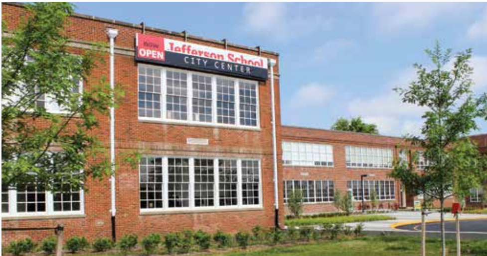
The College opened the PVCC Jefferson School Center in downtown Charlottesville in 2013 to increase access to classes and provide a home to its Culinary Arts Associate of Applied Science degree program.

Every three years, PVCC conducts a Community Leaders' Survey as part of our three-year strategic planning process. Civic, political and business leaders in Central Virginia are asked how well the College is doing and what can we do better. More than 200 completed surveys were received by mid-June 2013. Among the findings, 99 percent of community leaders felt that PVCC is very or somewhat effective in offering accessible, affordable, high-quality educational programs that promote student success and community vitality, while nearly 97 percent felt that PVCC is an asset to our community. Ninety-five percent rated PVCC as offering high-quality academic programs. Ninety-one percent indicated that PVCC prepares students for successful careers, and nearly 90 percent indicated that PVCC prepares students for success at four-year colleges and universities. Suggestions submitted by respondents are considered in development of the College's strategic plan.