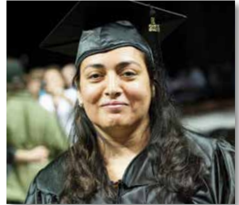
PVCC awarded 736 degrees and certificates to students graduating during the 2013-14 academic year.