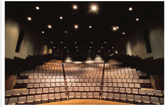
Main Stage Theatre

Another opportunity to support arts programming at PVCC provides for the naming of the theatre itself in recognition of a gift of $500,000.