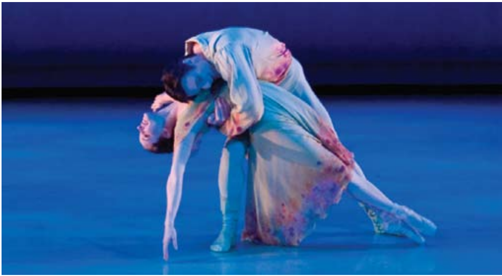
The Richmond Ballet performs annually at PVCC.